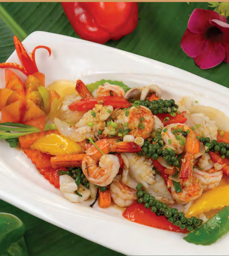
18. ឆាភ្លើងសមុទ្រម្រេចខ្លី Small 8.50 | Big 16.00 Stir-Fried Seafood with Green Pepper