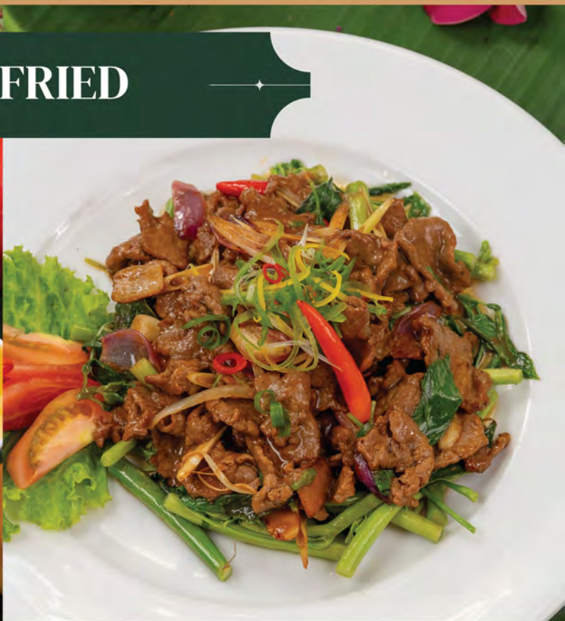
15. ជ្រក់ព្រៃឆាត្រៀងឬឆាភ្នំ Small 12.00 | Big 19.50 Wild Boar Stir-Fried with Khmer Spices or in Keng Curry