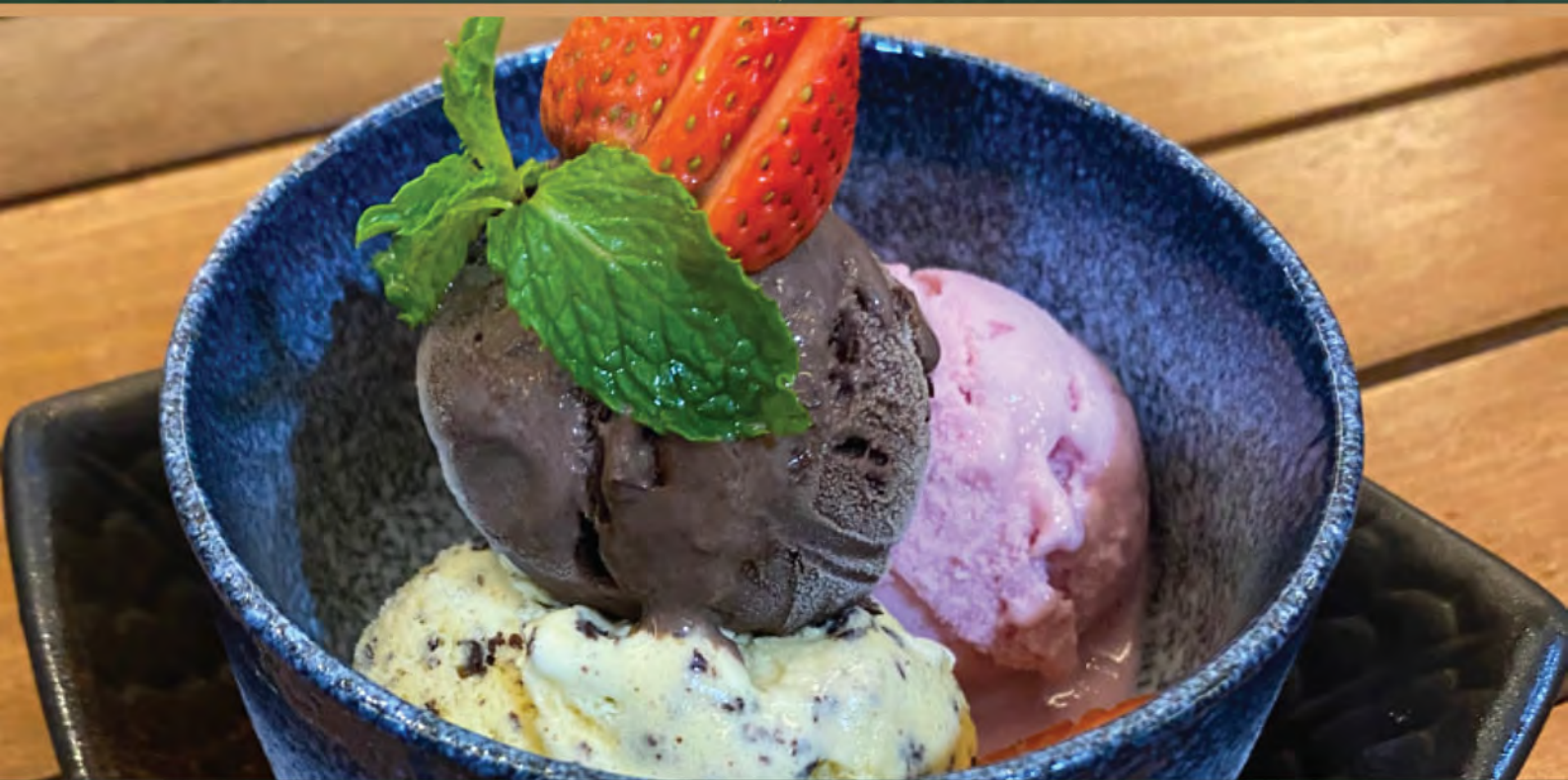
56. កាដឹម Home Made Ice Cream

(per scoop) Ask selection to service member