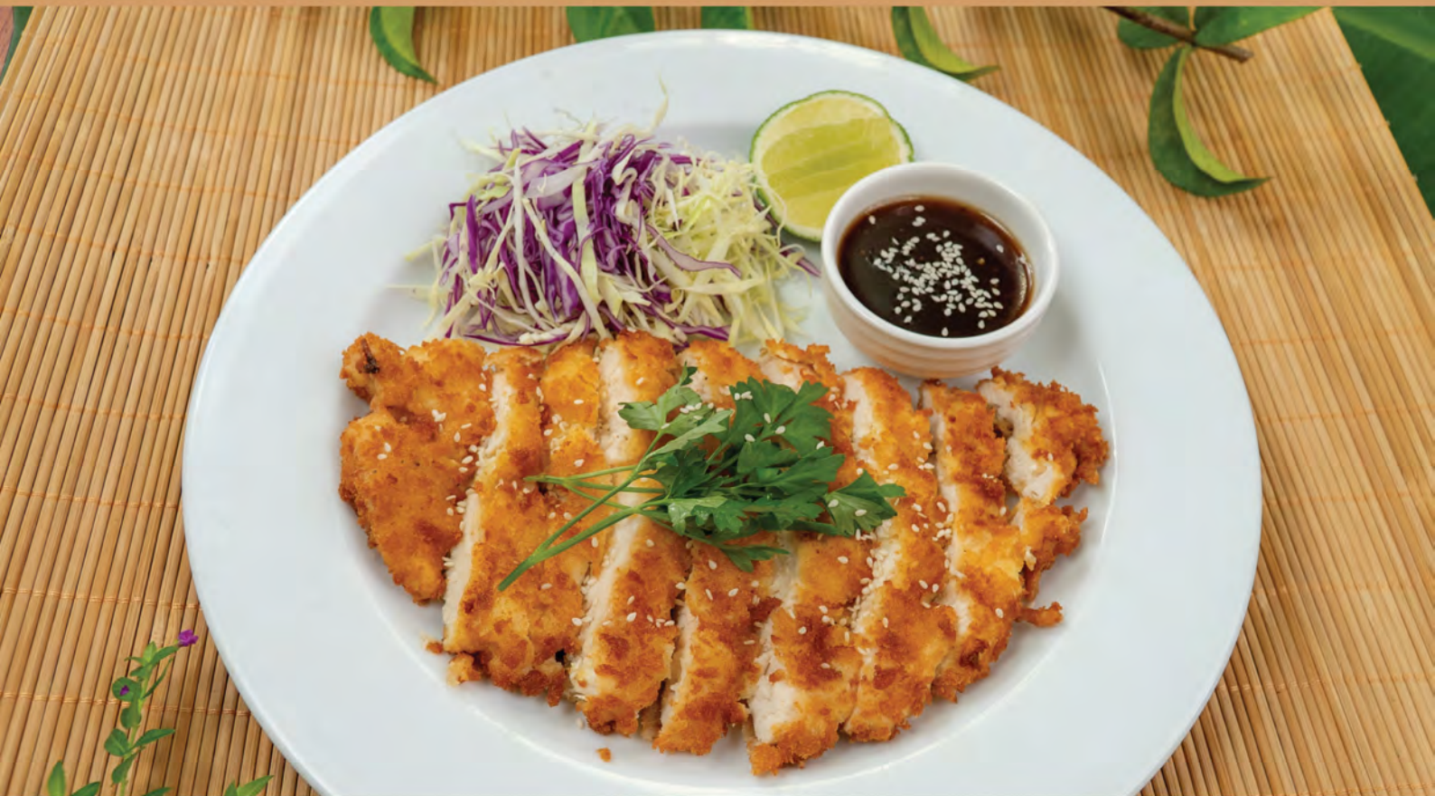
24. មាន់បំពងម្សៅទឹក Katsu 8.50 Deep-Fried Chicken Katsu