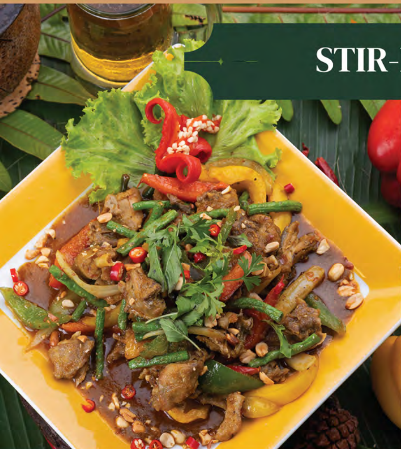
14. ឆាត្រៀងសាច់គោឬមាត់ Small 8.50 | Big 15.00 Stir-Fried Khmer Spice with Beef or Chicken