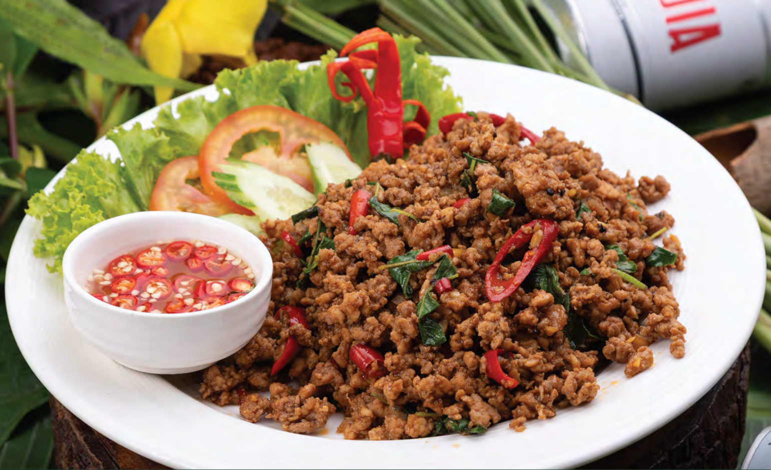
20. ឆាភ្លើងសាច់ចិញ្ច្រាំ គោ, ជ្រូកឬម្នាត់ Stir-Fried Spicy Minced (Beef, Pork, Chicken)