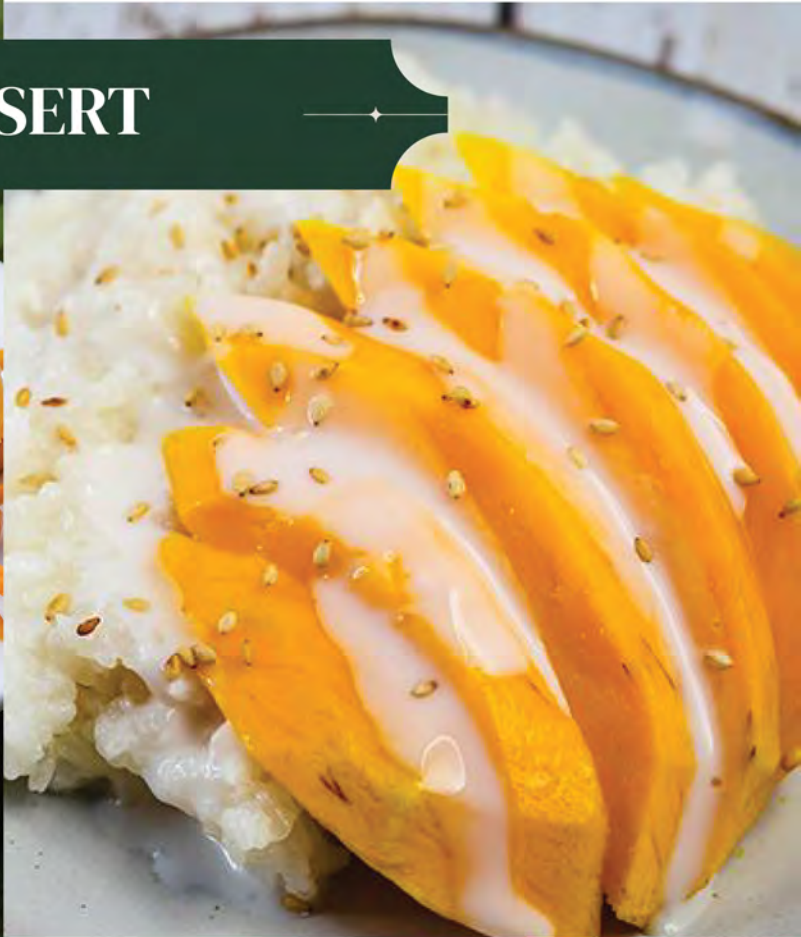
55. បាយដំឡើងស្វាយទុំ Mango Sticky Rice