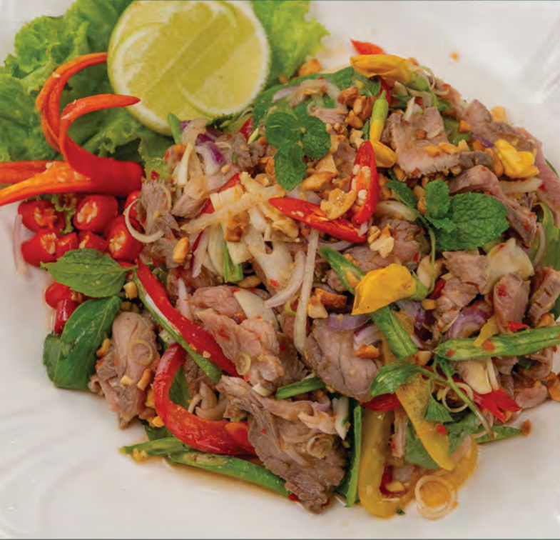
1. ញ៉ាំសាច់គោអាំង Small 8.50 | Big 15.00 Grilled Beef Salad