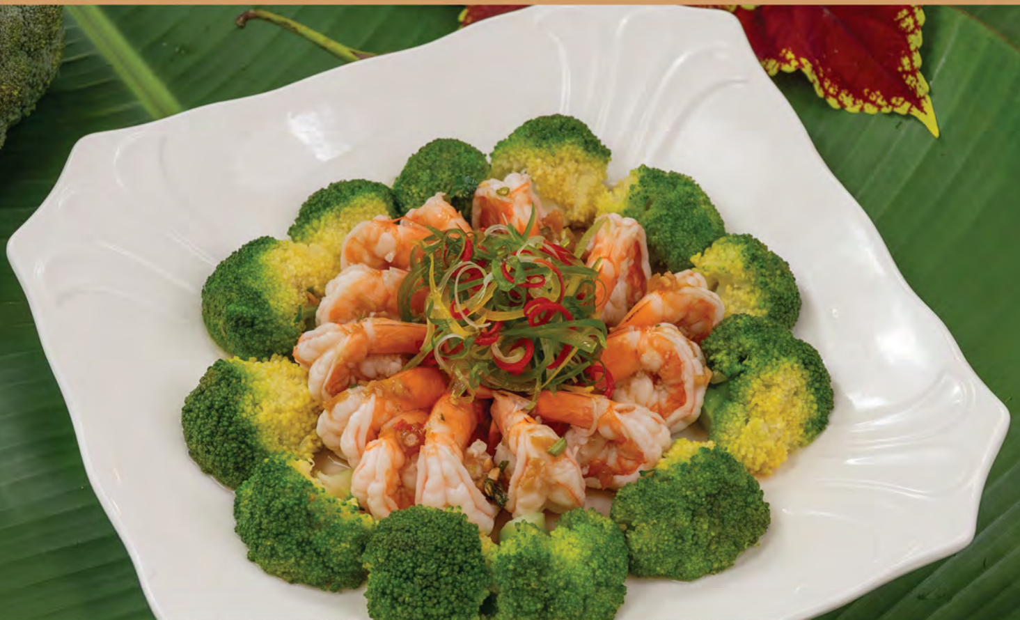
21. បង្ហាស្រុះផ្កាខាត់ណា Steamed Prawn with Broccoli and Oyster Sauce, topped with Crispy Garlic