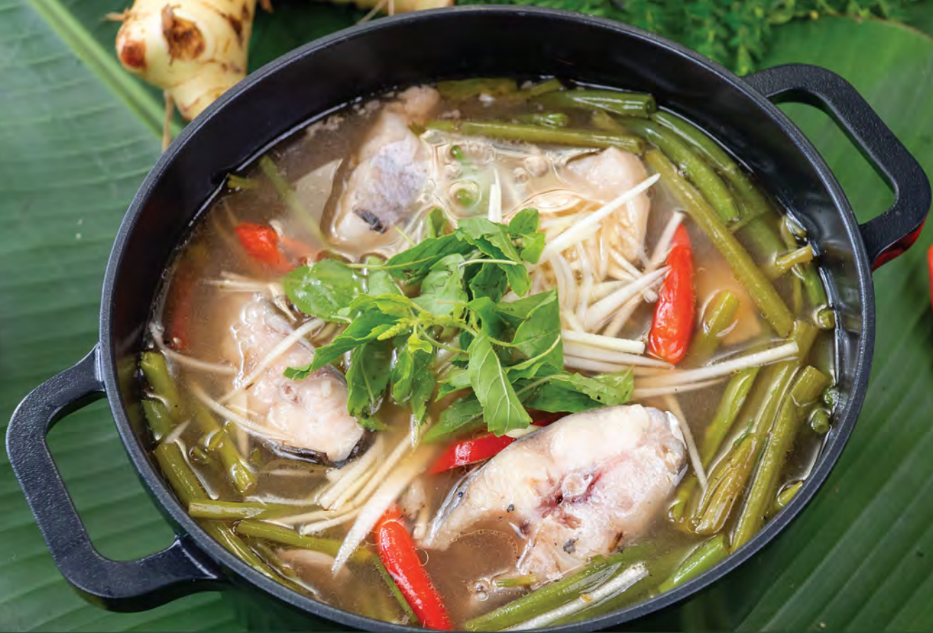
12. ស្លាជ្រក់ (បង្កា មាត់ ឬ ត្រី) Small 9.00 | Big 15.00 Sour Soup with Prawn, Chicken or Fish