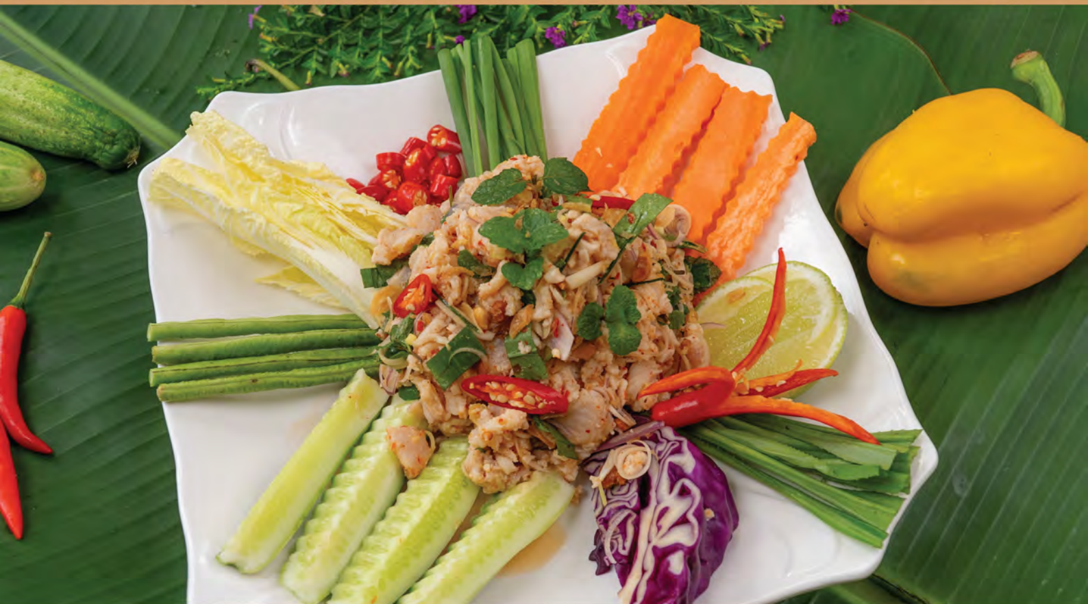
3. ឡាប (គោ, ជ្រូក, ឬ ត្រី) Small 9.50 | Big 16.00 Beef, Pork or Fish Larb Salad