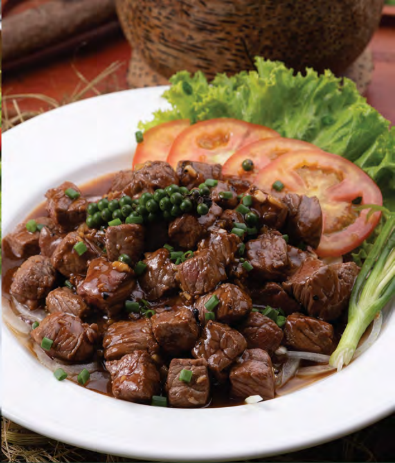
17. ឡូកឡាក់សាច់គោ Small 8.50 | Big 16.00 Cambodian Beef Lok Lak