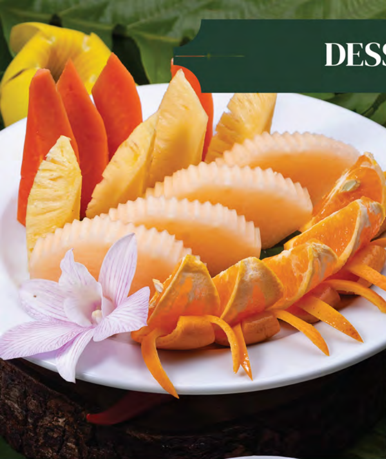
54. ផ្លែឈើស្រស់តាមរដូវ Seasonal Fresh Fruit Platter