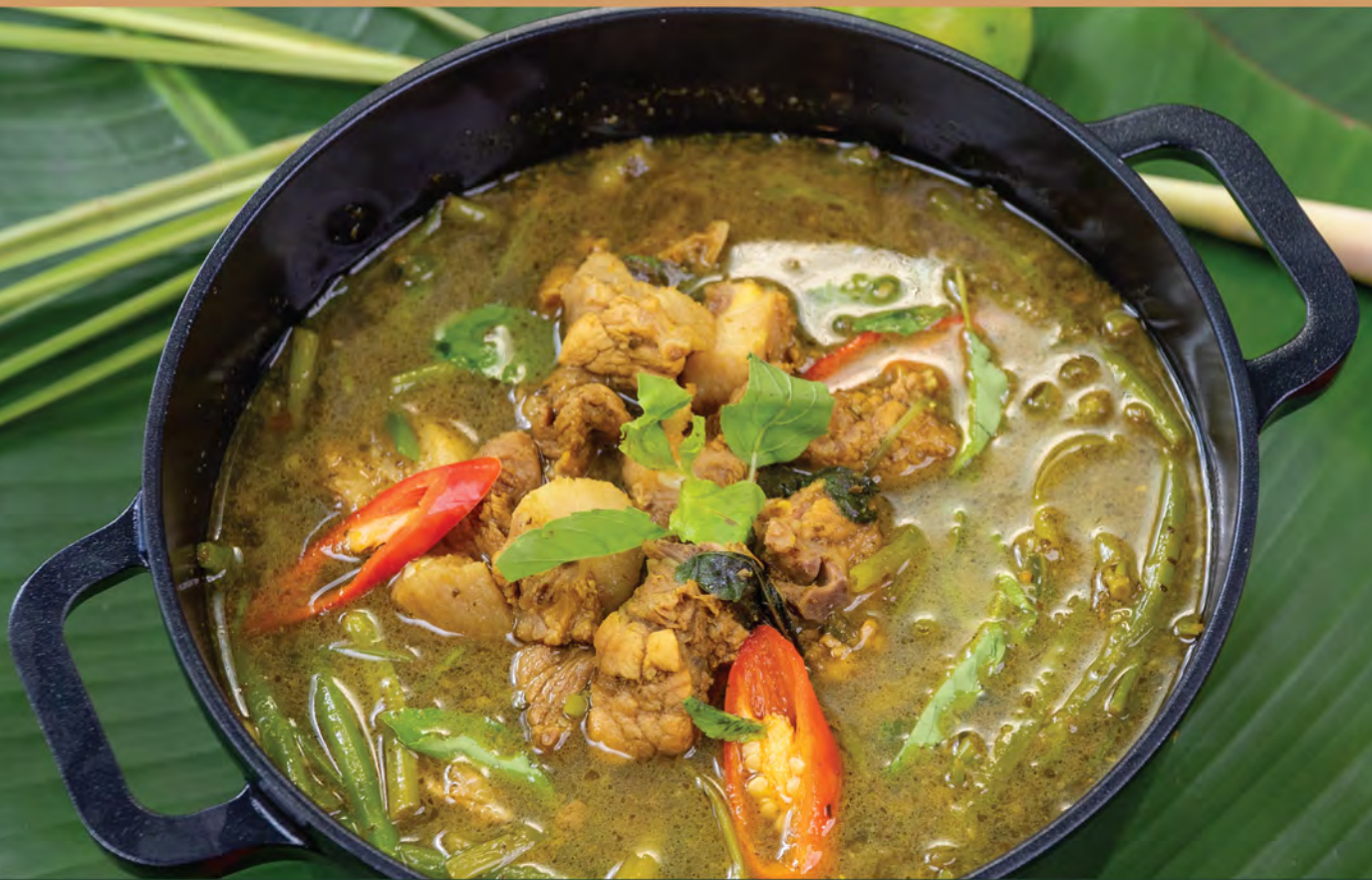
11. សម្បូរម្លូត្រៀង (ឆ្អឹងជំនីជ្រូក, ជ្រូកព្រៃ ឬសាច់គោ) Authentic Cambodian Soup with Pork Ribs, wild Boar or Beef