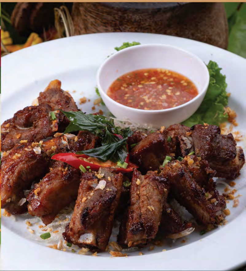
19. ភ្លើងជីជ្រូកបំពងខ្លីមស Small 8.50 | Big 16.00 Deep-Fried Marinated Pork Ribs with Garlic