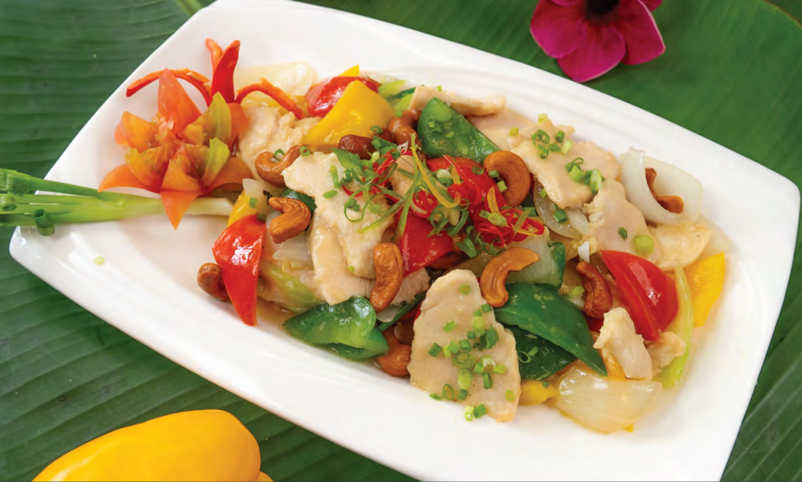
22. ឆាសាច់មាន់ត្រាប់ស្វាយចន្ទី Small 8.00 | Big 15.00 Stir-Fried Chicken with Cashew Nuts