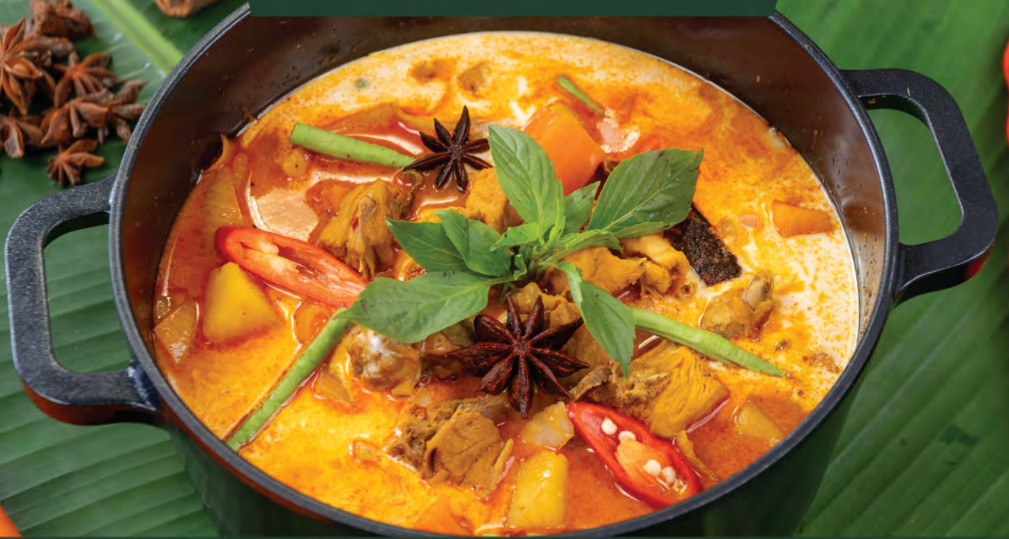
10. តុងយ៉ាំសាច់មាន់ឬ ត្រៀងសមុទ្រ Tom Yam Soup with Chicken or Seafood